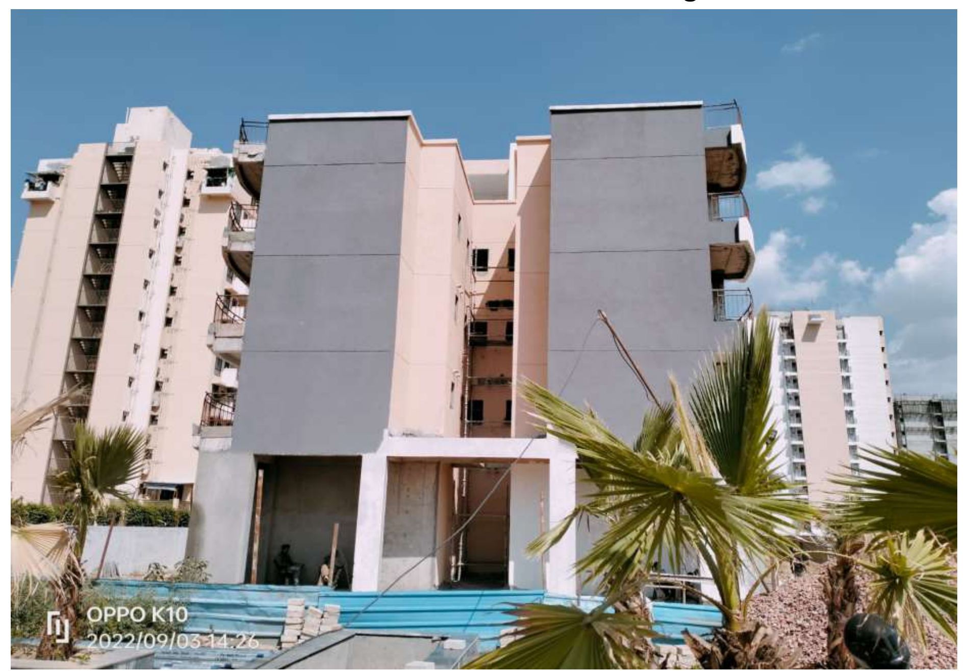
3BHK T1 External Paint Work in Progress