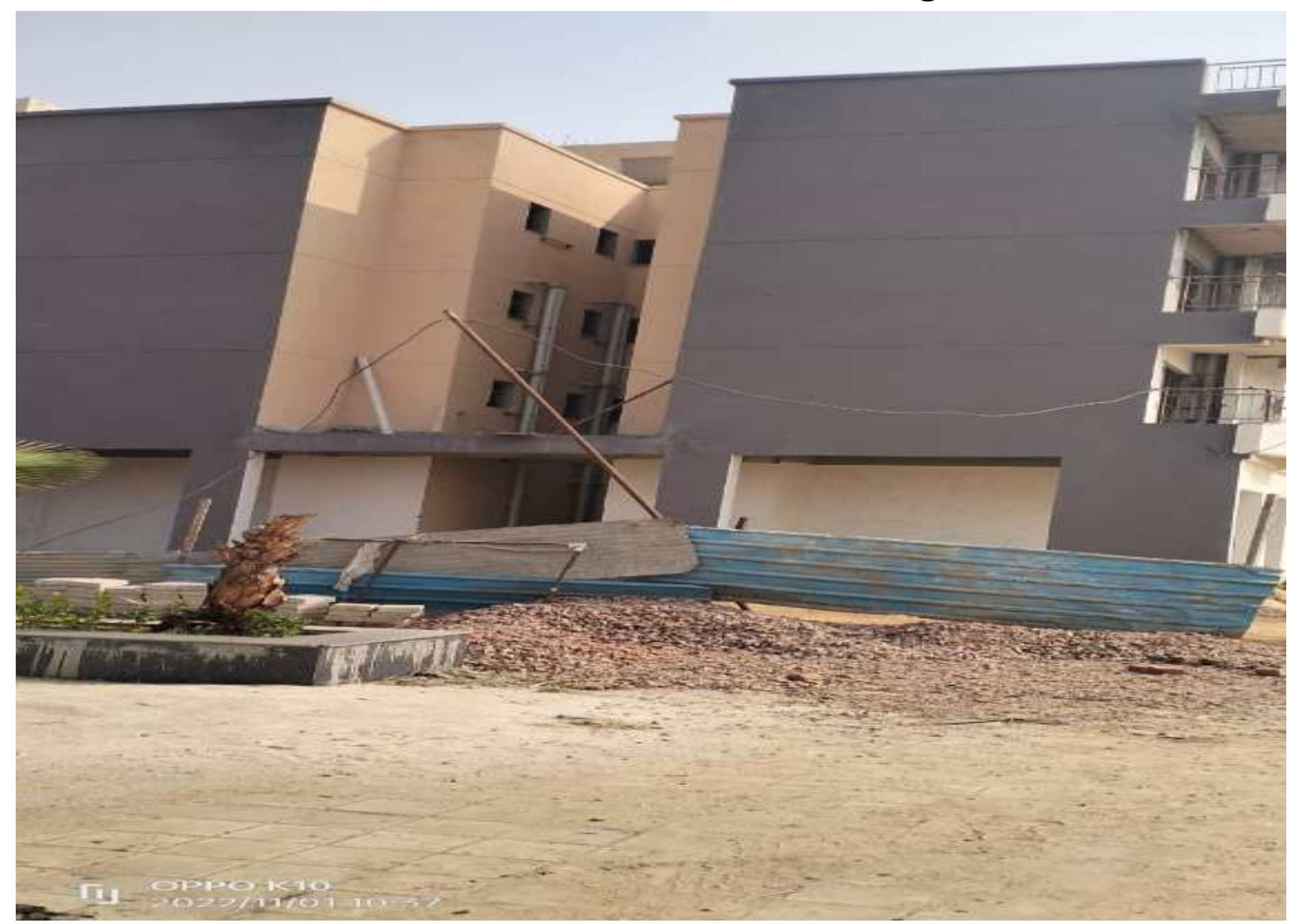
3BHK T1 External Paint Work in Progress