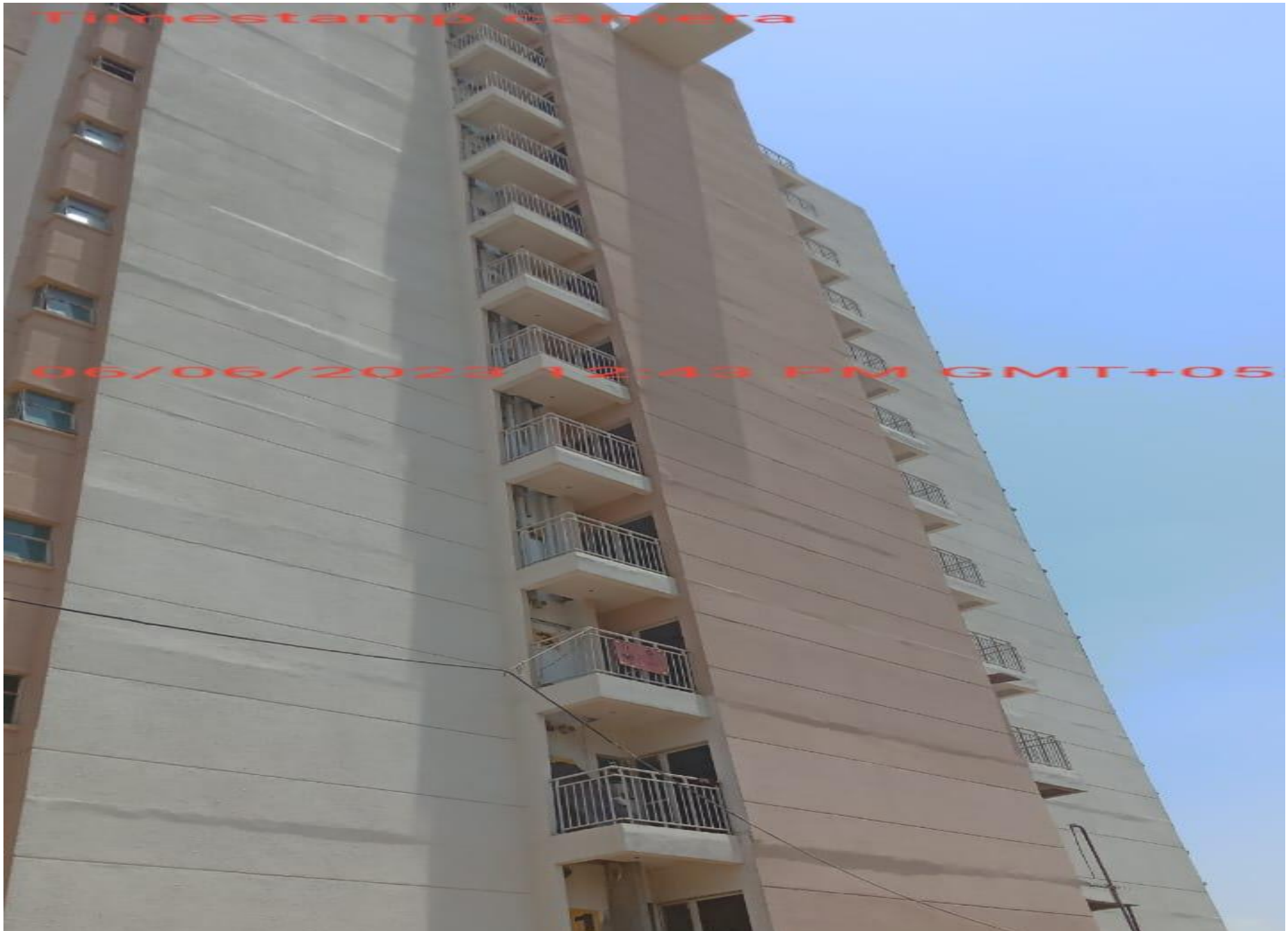
2BHK Tower 2A/T5 External paint work in progress.